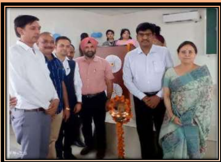
Invited Talk On Block Chain Technology, 2022