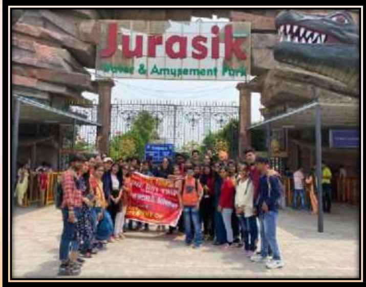
JURASIK PARK, SONEPAT