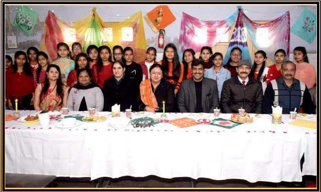
“CAFETERIA” ORGANIZED BY DEPARTMENT OF HOME SCIENCE