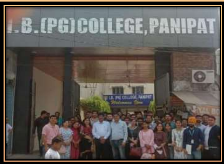
WATER PARK, SONEPAT