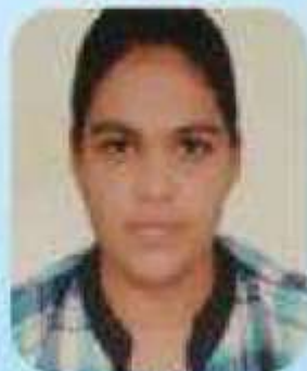
PARTIBHA BSC-III NON-MEDICAL