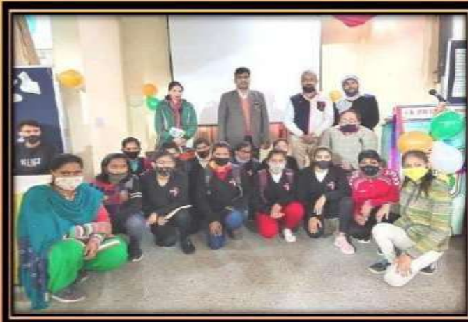
Two Days Hardware Exhibition