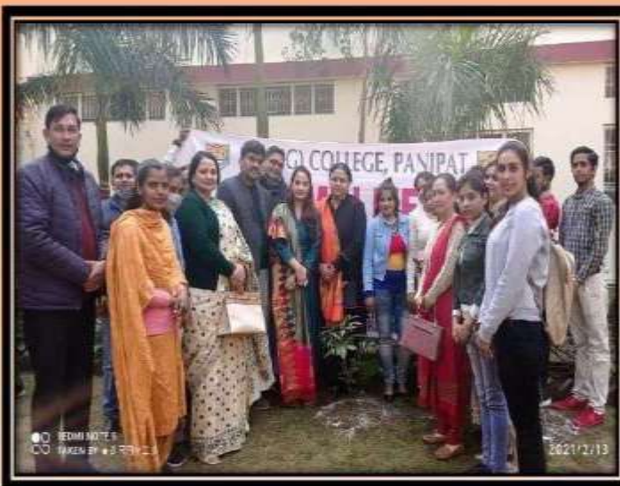
ALUMNI MEET - 2021