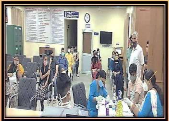
Mega Vaccination Drive against Corona Virus