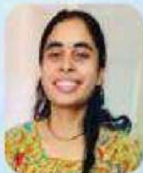
SWATI BSC-III MEDICAL