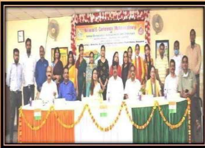
National Conference on "Indian Democracy: Achievements & Challenges"