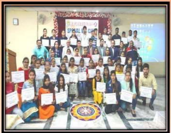
Special 7-Days NSS Camp at Village Khotpura, Panipat