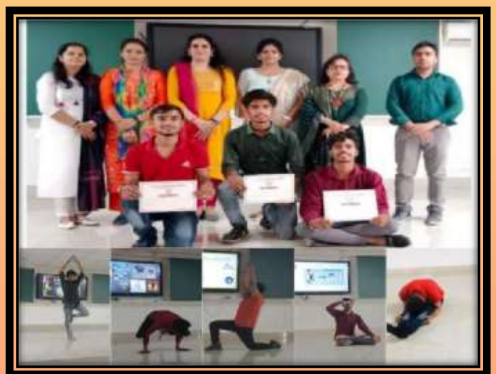
International Yoga Day Activity, 2022