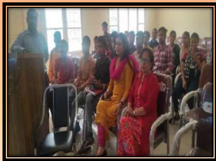
Lecture On Advanced Excel, 2022