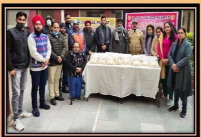
Distribution of Rice & Pulses to Needy People