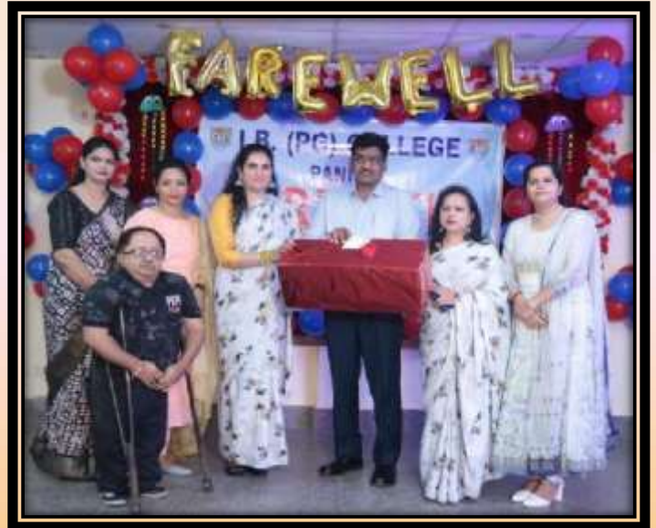
Farewell Program, 2022