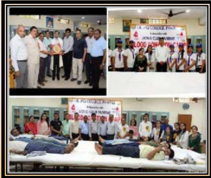
Blood Donation Camp, 2022