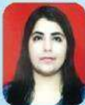
KOYANA BSC-III BIO-TECH.