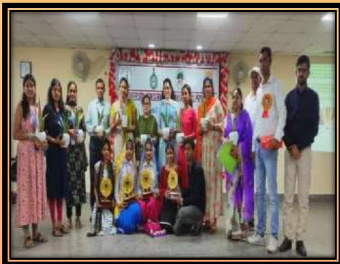
Lecture On Biodiversity, 2022