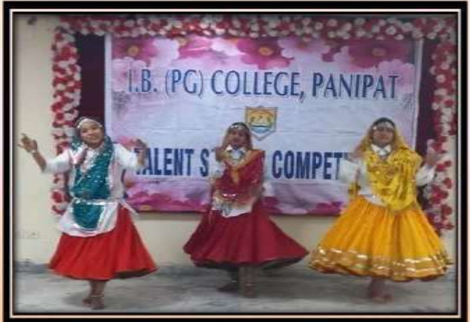
Students Performing at Talent Search Competitions, 2021