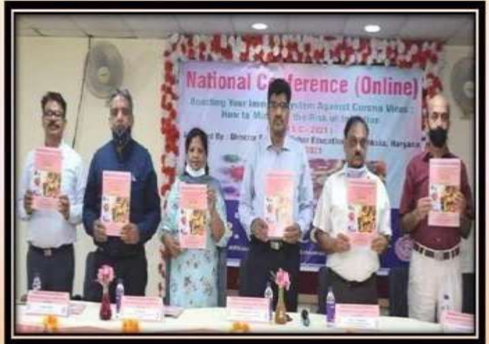
National Conference on "Boosting Your Immune System Against Corona Virus"