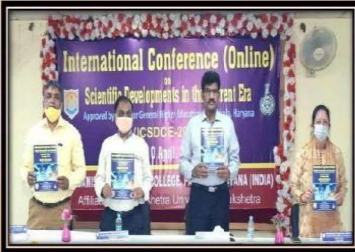
International Conference on "Scientific Developments in Current Era"