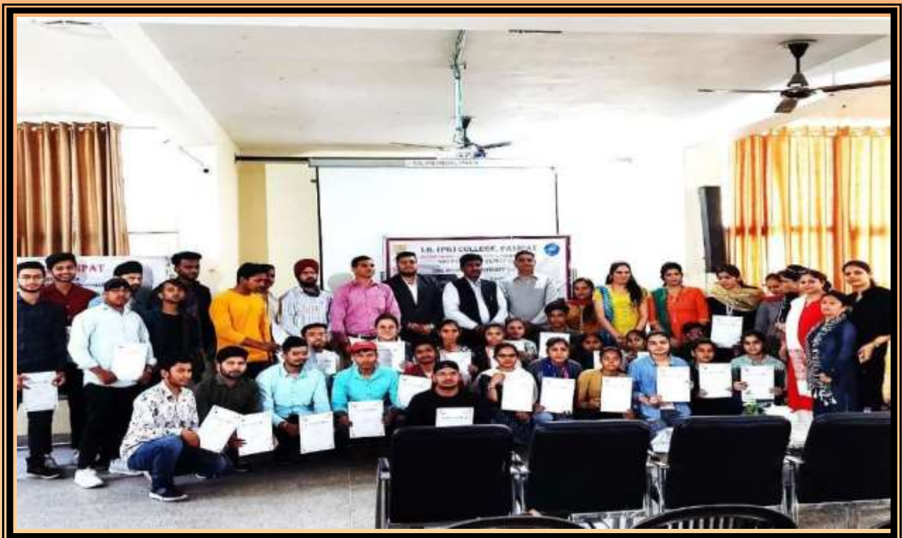
TEAM TALLY- ESSENTIAL CERTIFICATE COURSE ORGANIZED IN COLLABORATION WITH TALLY ACADEMY BANGALORE