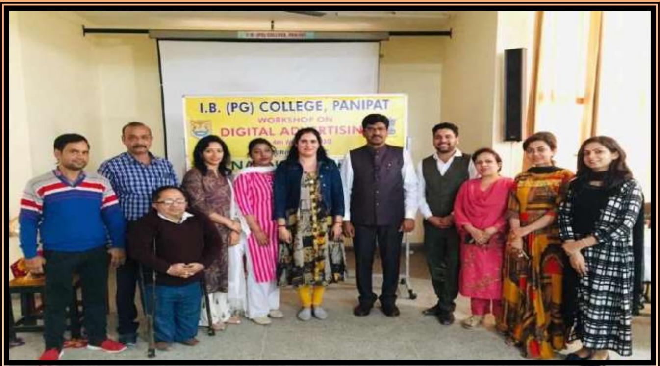
WORKSHOP ON DIGITAL ADVERTISING ORGANIZED BY DEPARTMENT OF COMPUTER SCIENCE