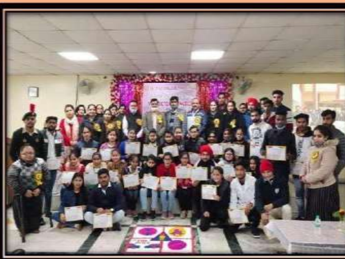
32 nd National Road Safety Week, 2021