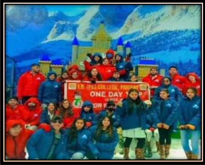
SNOW WORLD, SONEPAT