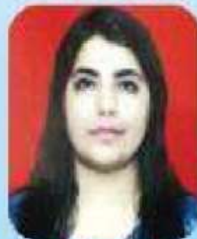
KOYANA BSC-III BIO-TECH.