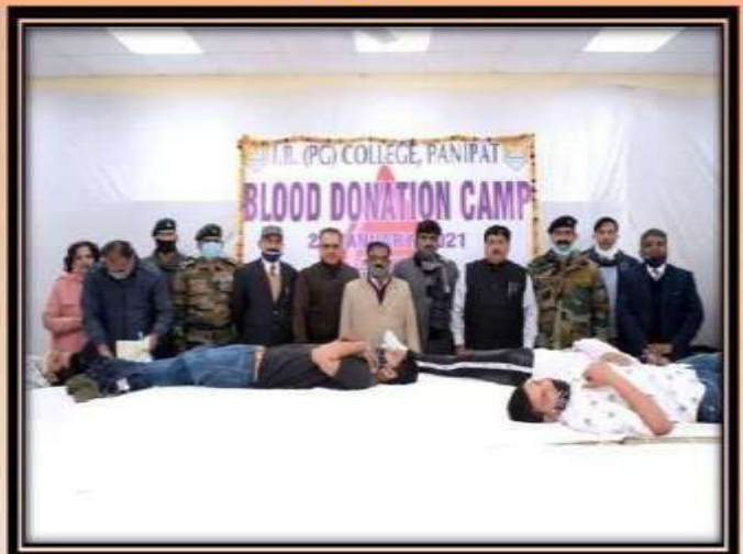
Blood Donation Camp, 2021