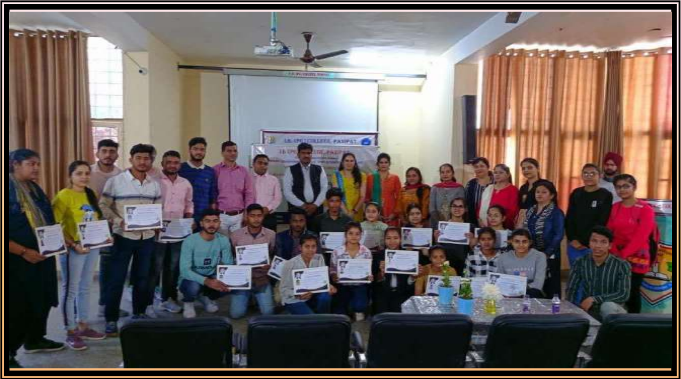
TEAM PYTHON CERTIFICATE COURSE ORGANIZED IN COLLABORATION WITH BICA ACADEMY PANIPAT