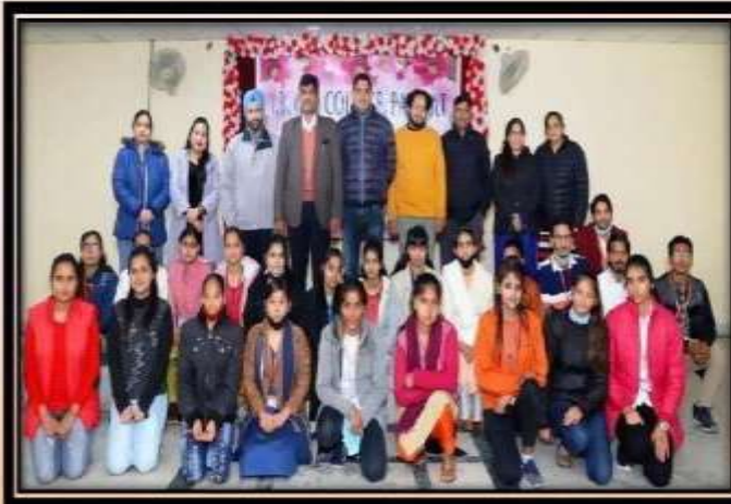
Winners of Talent Search Competitions, 2021